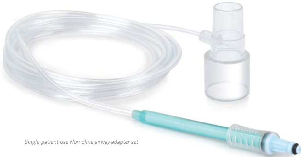
Single-patient-use Nomoline airway adapter set

No moisture sampling for extended monitoring of intubated patients